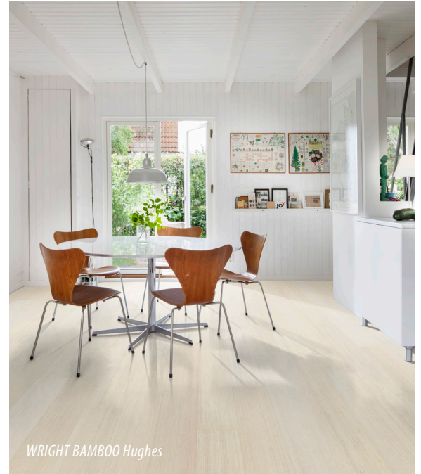
WRIGHT BAMBOO Hughes